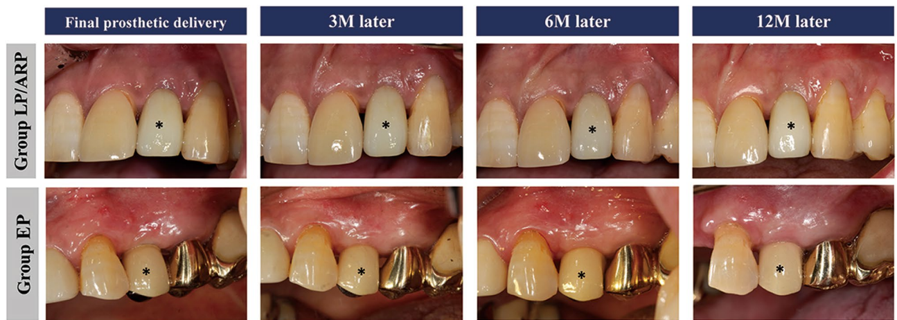
Figure 1. Clinical photographs over time. Asterisk indicates the implant crown included in the present study.

In the case of bone augmentation, healing caps were connected after 3–5 months of healing. Soft tissue augmentation was not performed in any case.