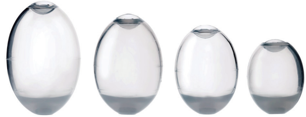
Figure 1: Torosa™ saline-filled testicular prostheses by Coloplast.