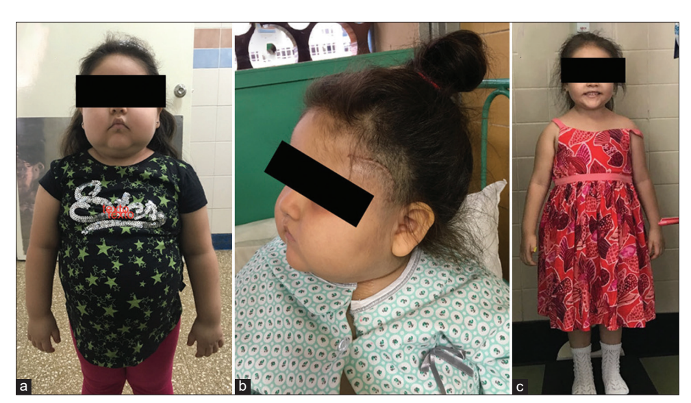
Figure 2: Patient before surgery (a), after transcranial surgery through mini-pterional approach (b), and at 1-year follow-up. No intraoperative or postoperative complications occurred.

ACTH: Adrenocorticotropic hormone, ETS: Endoscopic Transsphenoidal surgery, MAP: Mean arterial pressure, MTS: Microscopic transsphenoidal surgery, NA: Not available, TC: Transcranial surgery