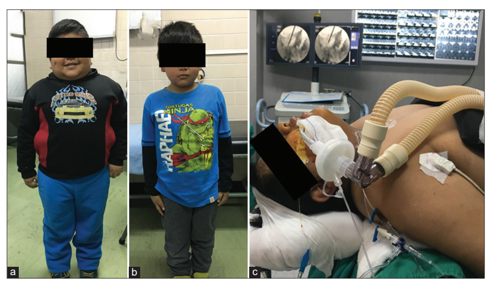
Figure 3: Patient before transcranial surgery through mini-pterional approach (a) and at 1-year follow-up (b). Another patient in position for microscope-guided endonasal transsphenoidal surgery (c).