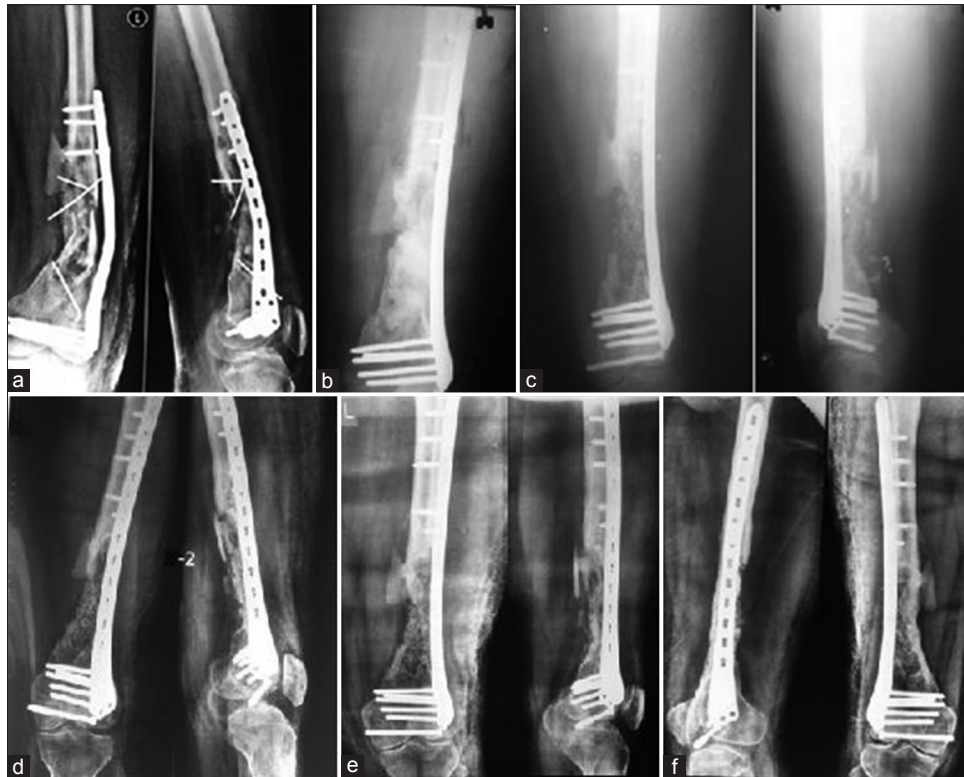
Figure 3: (a) A case of infected nonunion of femur (b) treated with distal femoral locking plate and antibiotic cement spacer (c) filling of gap with bone graft mixed with beta-tricalcium phosphate based composite ceramic as expander (d) follow up at 6 weeks (e) follow up at 6 months (f) follow up at 1 year