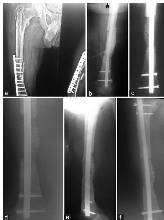
Figure 2: (a) A case of infected nonunion of femur (b) treated with antibiotic-loaded cement coated interlock nail and antibiotic cement spacer (c) filling of gap with bone graft mixed with beta-tricalcium phosphate based composite ceramic as expander (d) follow up at 6 weeks (e) follow up at 6 months (f) follow up at 1 year

weight on the extremity without pain and radiographs showed consolidation at 3/4 cortices in orthogonal views after first bone-grafting [Figures 2 and 3] A case showing failure (breakage of implant) in tibia is demonstrated in Figure 4.