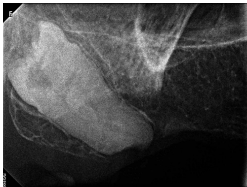
Fig. 2. The right inverted upper third molar.