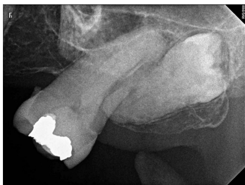
Fig. 3. The left inverted upper third molar.

The patient was informed about the presence of the impacted and inverted maxillary third molars. Then the case was discussed with the prostodontist and the final treatment plan was to create a removable complete denture after clearance of the available teeth. Regarding the inverted maxillary third molars, treatment options discussed were to extract or to leave in place. Thereafter, the treatment options were fully explained to the patient, including the risks versus the benefits of surgical removal of such impacted teeth. Finally, conservative management was selected, with the patient's agreement, and the inverted third molars were left in situ. This case report was registered in the institute research center with a registration number of (FUGRP/2014/175).