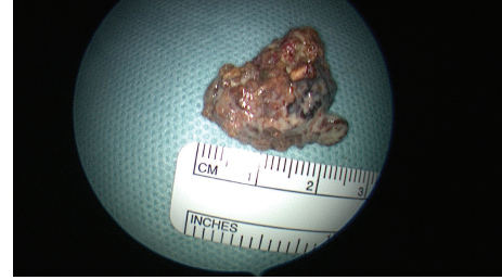
FIGURE 3: Tonsillolith specimen.

Tonsillolith arises from dystrophic calcification despite normal serum calcium and phosphate levels [4]. The mechanism by which these calculi form is still disputed, though they appear to result from the accumulation of material retained within the tonsillar crypts, along with the growth of bacteria and fungi—sometimes in association with persistent chronic purulent tonsillitis [3]. Repeated episodes of inflammation may produce fibrosis at the openings of the tonsillar crypts. Bacterial and epithelial debris then accumulates within these crypts and contributes