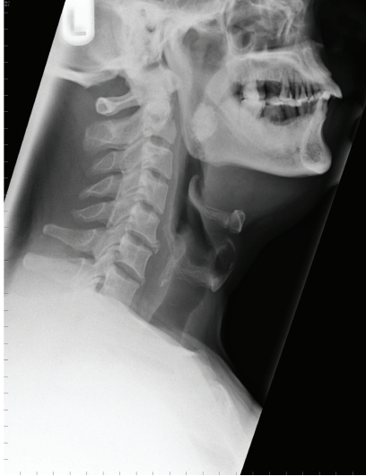
FIGURE 1: Lateral neck radiograph demonstrating a large tonsillolith.