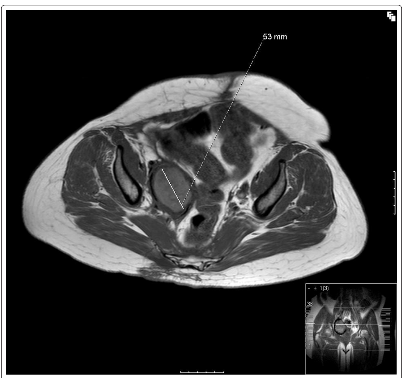
Figure 2 MRI scan of the pelvis after two years on sirolimus, demonstrating a reduction in size of the perivascular epithelioid cell tumor (PEComa) (measuring 53 mm) following treatment with sirolimus.

melanosomes. In this case the tumor cells expressed HMB45, melan A and smooth muscle actin.