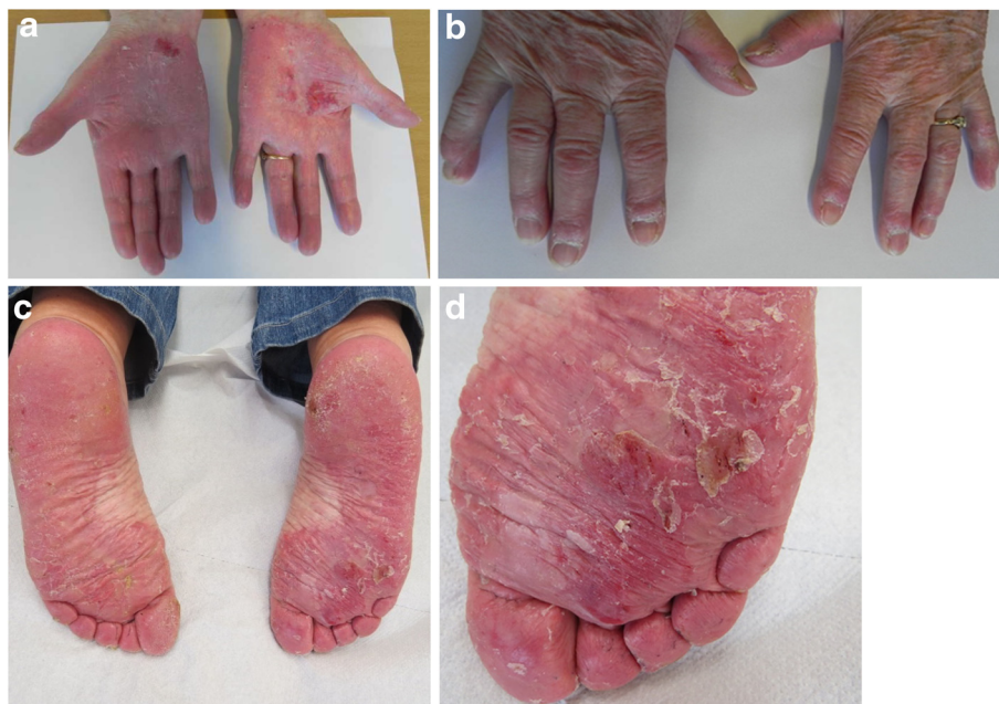
Fig. 1 Upper panel: Hyperkeratosis of the palms with erythema, scaling, erosions and fissuring. Dystrophic finger nails with spooning. Lower panel: Hyperkeratosis of the soles with erythema, scaling, erosions and fissuring

Genomic DNA purified from a blood sample from the patient was analyzed at All Wales Molecular Genetics Laboratory, Institute of Medical Genetics, UK using bi-directional Sanger sequencing of the WNT10A gene. The patient was homozygous for a nonsense mutation in the WNT10A gene, c.321C > A, p.Cys107*.