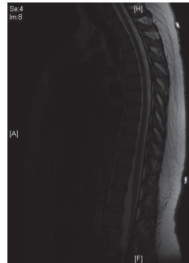
FIGURE 3: MRI at 6 weeks postpartum showing complete resolution of the spontaneous epidural hematoma.

Our patient achieved excellent outcomes from strict blood pressure control without undergoing invasive neurosurgery. The standard of care of neurosurgical treatment of SEH