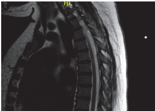
FIGURE 2: MRI T2 sagittal view of epidural blood collection which has decreased in size to 2-3 mm.

significant predisposing factors. Spinal AV malformations, particularly dural AV fistulas, affect males more often than females, with the average age at diagnosis being 50s-60s [20]. This makes the presence of AV malformations in obstetric patients significantly less likely, and the diagnosis of ruptured SEH easy to miss. This is clinically significant because AV malformations have the potential to precipitate spontaneous hemorrhage and/or cord ischemia, and pregnancy increases the risk of hemorrhage from AV malformations [21].