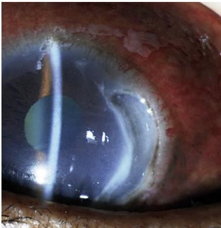
Fig. 3. Left eye, 6 days after initial presentation. Initially an ulcer with minimal thinning, the marginal guttering has deepened considerably.