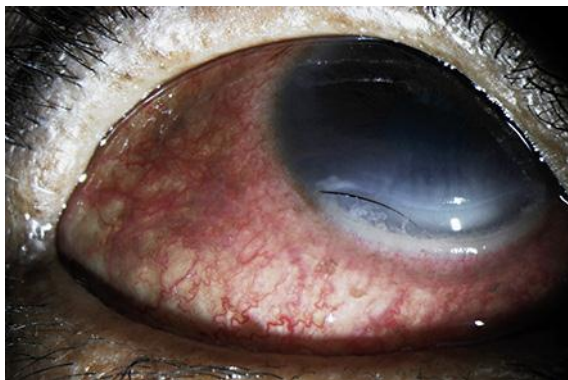
Fig. 1. Right eye, 6 days after initial presentation. Three days before this photograph, the eye was examined and no ulceration was found.