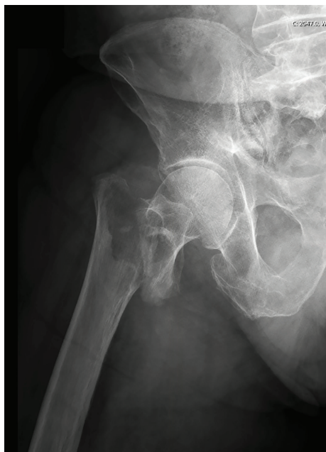
FIGURE 1: Plain X-ray of the painful hip and pelvis diagnosed a comminuted intertrochanteric hip fracture (grade 31 A2 according to the AO classification).

intertrochanteric hip fracture was diagnosed on a plain X-ray of the painful hip and pelvis (grade 31-A2 according to the AO classification) (Figure 1). Intravenous pain medication was administered at the emergency department, and the patient was transferred to the operating room five hours after admission.