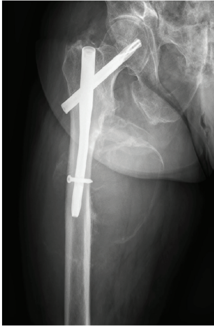
FIGURE 3: Plain X-rays eight months postoperatively showed the presence of a medial mass centred over the distal locking screw with calcification of the peripheral borders, suggestive for an (infected) hematoma. Compression and severe osteolysis of the medial border of the femur were remarked.