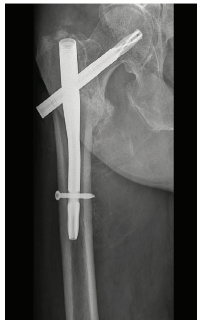
FIGURE 2: Plain X-ray of the right hip six weeks postoperatively showed a good position of the intramedullary nail.

Eight months postoperatively, the patient presented to polyclinical consultation because of a progressive swelling of the right thigh. There was no recent trauma, episode of fever, or illness. Clinical examination revealed a nontender diffuse swelling over the proximal part of the right thigh