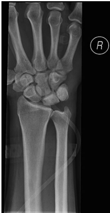
Fig. 3 Comparison X-ray of the right wrist showing a fibro-cartilaginous coalition of the lunate and triquetrum