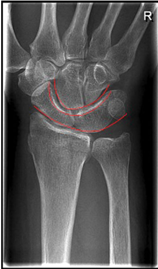
Fig. 7 The arcs of Gilula drawn on another patient's X-ray with an os lunato-triquetrum. The first arc is along the proximal border of the proximal carpal row, the second along the distal border of the proximal carpal row, and the third along the border of the distal carpal row

involve massive soft tissue trauma to the hand and present often as open fractures [11, 14].