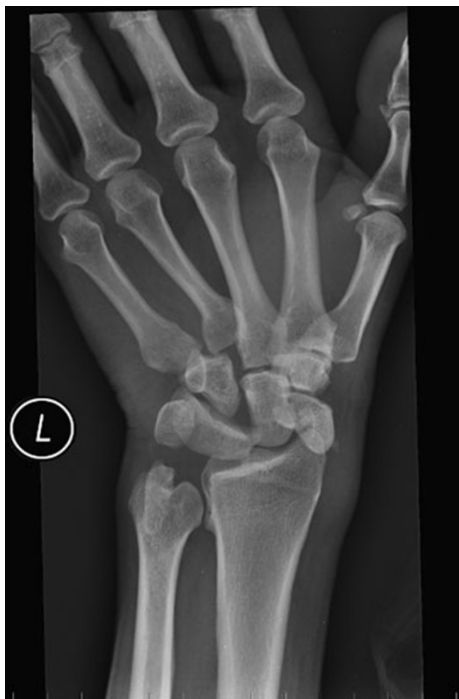
Fig. 1 An isolated scaphoid dislocation with carpal dissociation with a carpal anomaly. The sequella of a conservatively treated ulnar fracture 34 years earlier is still visible

The patient was brought to the operating room for open reduction and internal fixation of this complex wrist trauma. Because of the evident hematoma and the palpable dislocated osseous structures on the volar side, a volar approach was chosen. After the skin incision and evacuation of the hematoma, the volar ligamentous structures were found to be ruptured. A carpal tunnel release was performed for better exposure and decompression of the median nerve. Without any further elaborate preparation, the osseous structures could easily be identified. The