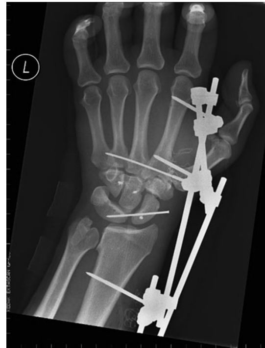
Fig. 5 The situation immediately after operative repair