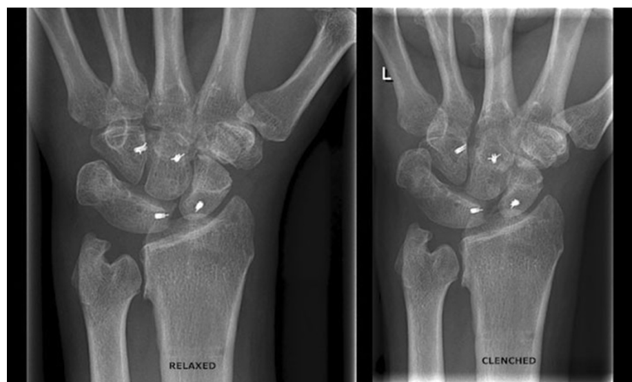
Fig. 6 Clenched fist radiograph compared with the relaxed condition

The proposed injury mechanism is that there is an axial trauma of the wrist while the hand is gripping an object in slight ulnar deviation [13]. Thus, as a result of the trauma, the hand is deviated ulnarly with force, as in a motorcyclist holding his handle bar and hitting an object. The force needed to obtain an axial carpal injury is considerable and often results in a fracture of the scaphoid or styloid process of the radius. For the same reason, these injuries mostly