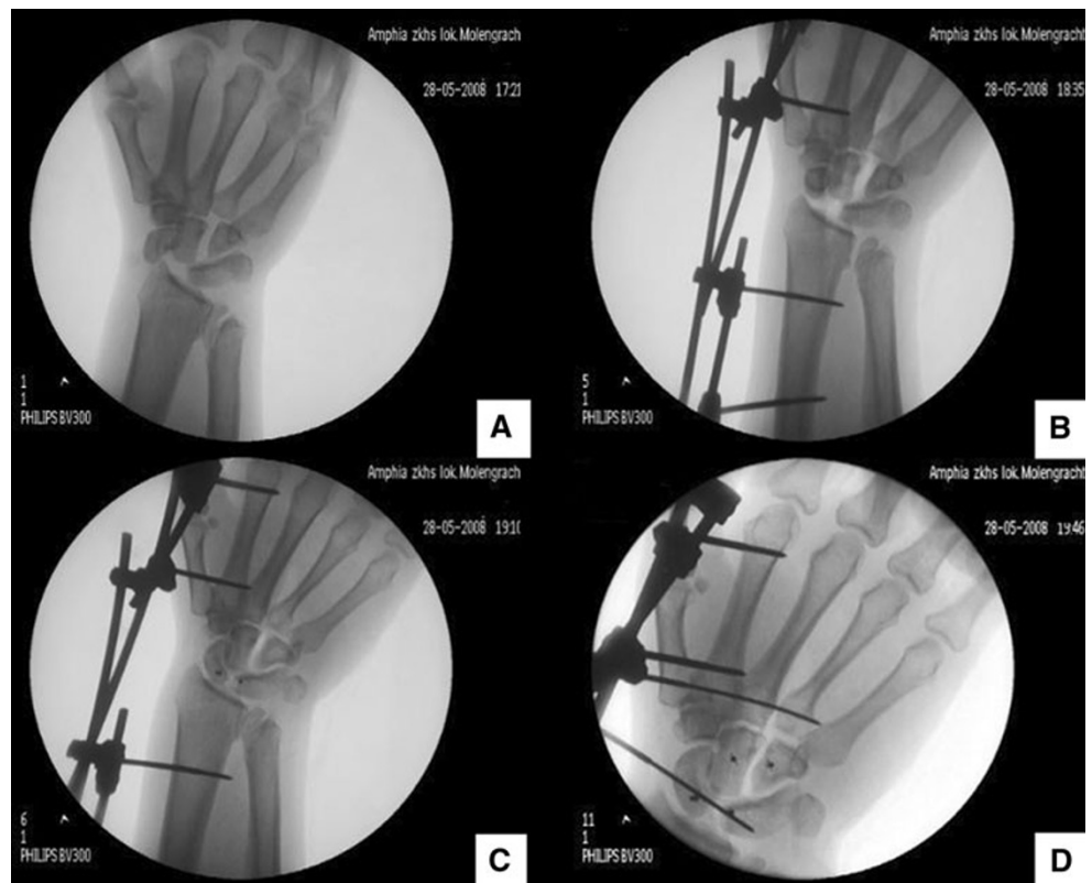
Fig. 4 Operative steps (a-d) as described in the text. a Initial situation. b After stabilization with an external fixator. c Scapho-lunate dissociation corrected with Mitek® bone anchors. d Final situation after placement of the FFS® wires, realigning the bases of the metacarpals and establishing carpal alignment