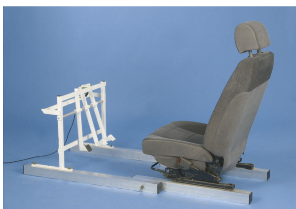
Figure 2 Custom-made apparatus to measure brake response time.