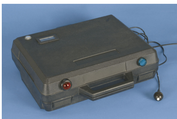
Figure 3 The external suitcase containing the logic gate electronics, the trigger, the green and red lamp, and the clock.

When the accelerator was completely depressed the green lamp shone, indicating that the patient did not 'drive' in a 'ready-to-brake fashion'. After 5 to 10