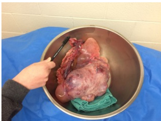
FIGURE 3 | Post surgical picture of the largest of the removed masses – the right testis.

In a study of dogs seen at veterinary teaching hospitals across North America, the two most common neoplasms in cryptorchid testes were Sertoli cell tumors and seminomas (6). Both tumor types have been associated with feminization syndrome (7, 8). Feminization syndrome is caused by the over production of estrogens and is characterized by clinical signs that may include bilateral symmetric alopecia, atrophy of sebaceous glands, skin thinning, flaccidity of the prepuce, enlargement of mammary tissue, and prostate dystrophy (8).