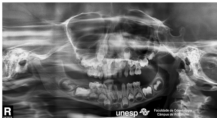
Figure 4 Orthopantomograph showing absence of a mandibular permanent incisor.

multidisciplinary. For maintenance of oral health, accurate intra-oral clinical and radiographic evaluations are required for patients with this syndrome in order to provide an early diagnosis of other abnormalities involving the primary and permanent dentitions.