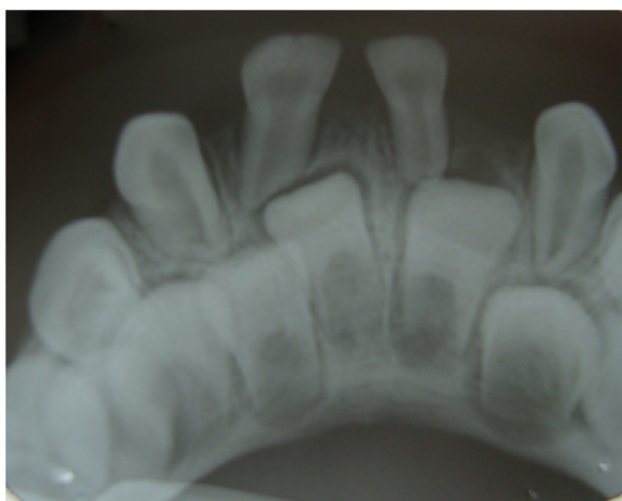
Figure 3 Periapical radiograph displaying a geminated mandibular right central primary incisor with one root and one root canal and absence of a mandibular permanent left incisor.

The following oral health status findings were observed at the initial clinical examination and in all follow-up appointments: no dental caries, low plaque indices, no supragingival calculus deposits, and no other periodontal problems. The following dental anomalies were clinically and radiographically noted when the primary dentition was complete: a geminated mandibular right central incisor with 1 root and 1 canal; the absence of a mandibular permanent left incisor (Figure 2 and 3); and congenitally missing primary teeth, namely, the mandibular right and left lateral incisors (Figure 2 and 3). In addition, agenesis of the mandibular left lateral permanent incisor germ was