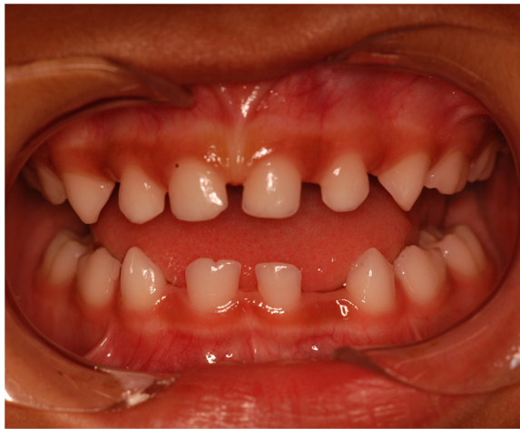
Figure 2 Intraoral view of the mandibular primary double right central incisor and congenitally absence of both right and left lateral primary incisors.

The following oral health status findings were observed at the initial clinical examination and in all follow-up appointments: no dental caries, low plaque indices, no supragingival calculus deposits, and no other periodontal problems. The following dental anomalies were clinically and radiographically noted when the primary dentition was complete: a geminated mandibular right central incisor with 1 root and 1 canal; the absence of a mandibular permanent left incisor (Figure 2 and 3); and congenitally missing primary teeth, namely, the mandibular right and left lateral incisors (Figure 2 and 3). In addition, agenesis of the mandibular left lateral permanent incisor germ was