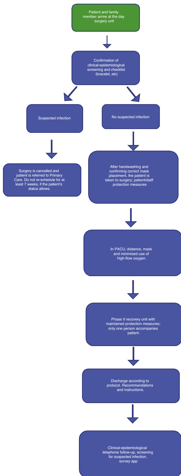
Fig. 2 – Patient flowchart in ambulatory surgery.