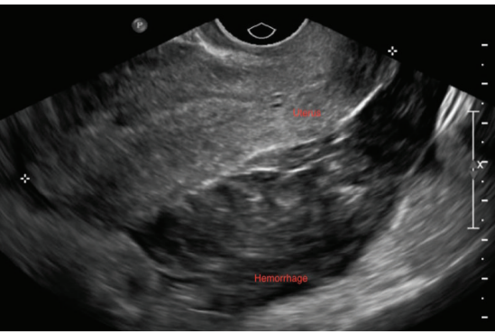
FIGURE 1: Transverse and longitudinal ultrasound images of the uterus showing intra-abdominal hemorrhage and no intrauterine pregnancy.

diagnosed with hemoperitoneum and ruptured ectopic pregnancy. Gestational tissue was identified during the surgery. Her postoperative recovery was unremarkable.