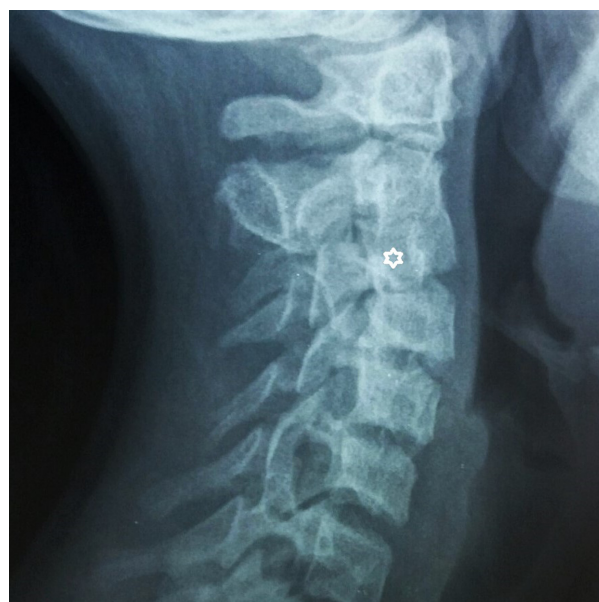
Figure 1. Static lateral X-ray of the cervical spine. The C3 hemivertebra is marked with a white asterisk.

Hemivertebra is a congenital failure in the formation and fusion of vertebral body ossification nuclei, resulting in the development of one side of the vertebral body. Its incidence is estimated at ~0.3 per 1000 live births [1].