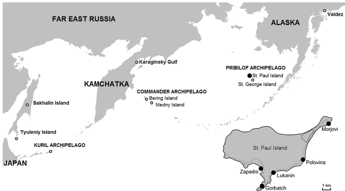
Fig. 1. Map showing the areas at which helminths of the northern fur seals ( Callorhinus ursinus ) have been studied by previous authors (gray circles) and the present authors (black circle) in the Bering Sea. The detailed map of St. Paul Island, Alaska with sampling sites (rookeries) is enlarged.

Additionally, four other tapeworm species have been reported from NFSs: Anophryocephalus ochotensis (Delyamure, 1955), Diphyllobothrium hians , Diphyllobothrium lanceolatum (Krabbe, 1865), and Pyramicocephalus phocarum (Fabricius, 1780), as well as phyllobothriidean plerocercoids Scolex pleuronectis Müller, 1788 (Delyamure, 1955; Dailey and Brownell, 1972; Margolis and Dailey, 1972; Yurakhno and Taikov, 1986; Yurakhno, 1998; Kamo, 1999). However, most of these taxa are not specific parasites of NFSs (such as D. hians , D. lanceolatum , or P. phocarum ), and may represent misidentifications of the morphologically variable A. pacificus and D. tetraapterus (Delyamure et al., 1985; Hernández-Orts et al., 2015).