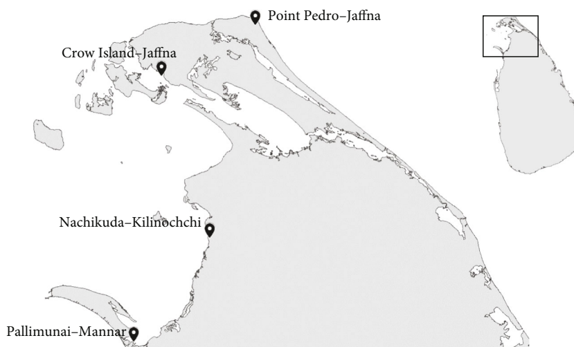
FIGURE 1: Map showing the sampling sites on the North and Northwest coast of Sri Lanka.

The percentage weight loss of H. spinifera ranged from 85.89 to 94.11%, while it was from 89.45 to 93.26% and 86.54 to 93.51%, respectively, for B. vitiensis and S. naso . The results indicated that considerable weight loss of fresh sea cucumbers can occur during processing, and this mainly depends on the target species and processing practices. The processing processes like long-time boiling and drying with electric dryers have made more contribution to the weight loss of the processed products.