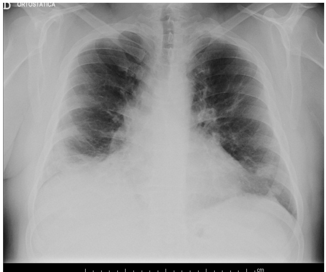
FIGURE 2: Chest radiography on discharge.

During the 17th day after admission, chest radiography was performed which showed significant improvement as only a few residual infiltrates were visible in both lung bases. Serology for Legionella pneumophila and urinary antigen detection tests were positive. Levofloxacin and respiratory kinesiotherapy were started. After clinical, analytical, radiological (Figure 2) and gasometric improvement (Table 3), the patient was discharged 21 days after admission.