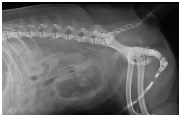
Fig 3. Contrast cystourethrogram from an 8-year-old castrated male Pug revealed numerous cystic and urethral calculi and a urethral diverticulum in the proximal urethra. Sludge-like material and small uroliths (<1 mm) composed of 100% struvite were removed from the bladder and urethra via cystoscopy, followed by cystotomy.

Transurethral catheterization was successful in relieving the obstruction in 5 dogs, whereas 4 dogs required additional procedures. In 1 dog, a contrast cystourethrogram revealed cystic and urethral calculi and a urethral diverticulum (Fig 3). Cystoscopy was performed so that laser lithotripsy and basket retrieval could be used to clear the urethral lumen. However, a urethral stricture prevented access, and a cystotomy was required. A large quantity of sludge-like material and small uroliths (<1 mm) was removed from the bladder and urethra. Retrograde transurethral catheterization was still not successful. Therefore, a scrotal urethrostomy was performed to allow urine voiding. The 2nd dog had a double contrast cystogram to further characterize the radio-opaque material identified on survey abdominal radiographs (Fig 1). Mineral opacity was present throughout the urinary bladder, raising concern for a large urocystolith. This dog had a cystotomy; the bladder was filled with large aggregations of struvite crystals; no urolith was found. It was noted in the last 2 dogs that urethral catheterization was difficult at initial presentation. In 1 dog, cystoscopy