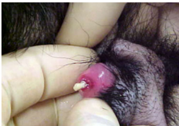
Fig 2. Urethral plug from a 2-year-old castrated male Pug protruding from the distal urethral opening. The crystalline portion of the plug was composed of 100% struvite interspersed in a matrix of cellular and proteinaceous material.

Transurethral catheterization was successful in relieving the obstruction in 5 dogs, whereas 4 dogs required additional procedures. In 1 dog, a contrast cystourethrogram revealed cystic and urethral calculi and a urethral diverticulum (Fig 3). Cystoscopy was performed so that laser lithotripsy and basket retrieval could be used to clear the urethral lumen. However, a urethral stricture prevented access, and a cystotomy was required. A large quantity of sludge-like material and small uroliths (<1 mm) was removed from the bladder and urethra. Retrograde transurethral catheterization was still not successful. Therefore, a scrotal urethrostomy was performed to allow urine voiding. The 2nd dog had a double contrast cystogram to further characterize the radio-opaque material identified on survey abdominal radiographs (Fig 1). Mineral opacity was present throughout the urinary bladder, raising concern for a large urocystolith. This dog had a cystotomy; the bladder was filled with large aggregations of struvite crystals; no urolith was found. It was noted in the last 2 dogs that urethral catheterization was difficult at initial presentation. In 1 dog, cystoscopy