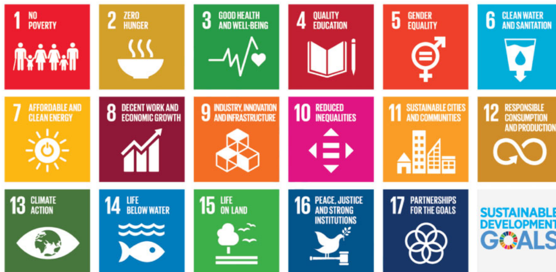
Figure 1 Sustainable Development Goals (United Nations, 2016). Approved by UNDP for non UN organizations.

Going into abstracts and actual papers of highest relevance led to a number of papers including reviews, scoping reviews, complex adaptive systems, theories of change, realist approaches and evaluations. We excluded those that by their titles had a specific disease, or very confined service programme focus. Indications of a possibly broader health systems relevance or a developing country focus led to abstract reading of 60 of them and full text reading of 20. They spanned the above-mentioned methods and largely outlined needs for complex methodological approaches and new interventions, but without solutions or ensured scale up of their priority setting, funding and management. The complexity of labelling, definitions, methodologies, scope and reporting is a finding in itself and did not provide adequate references to answer our health determinant focused study question.