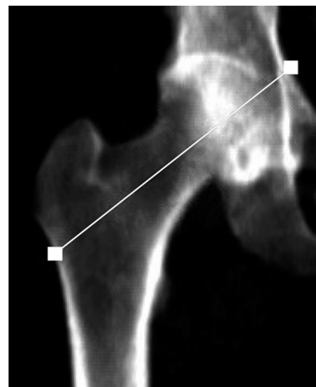
Figure 2 Hip axis length.

The dependent variable in the model was the FSI variable. The FSI values were categorized as follows: FSI > 1 (normal values); in the regression model these values were replaced by the 0 category, categorized FSI (FSI category = 0). FSI < 1 (pathological values); in the regression model these values were replaced by the 1 category, categorized FSI (FSI category = 1). A binary variable was produced with the working title FSI category in the