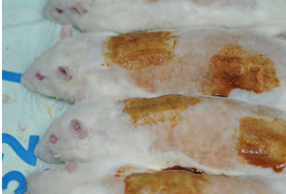
Fig. 1: 3 rd degree burn over upper back and 2 nd degree burn over lower back in 2 nd session.

Histological criteria was defined as following: for fibrosis (collagen bundles): normal bundle: 2, disorganized/edematous: 1, and amorphous: 0. For PMN, 40x field: 0-10: 2, 11-40: 1, >40: 0. Angiogenesis in 3 degree: mild, moderate and severe. Epithelialization was expressed as positive and negative.