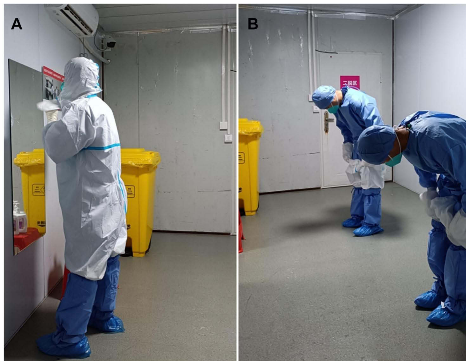
Figure 1 The third-party personnel take off the protective clothing. (A) Using the traditional supervision and management methods; (B) Using the new supervision and management methods.