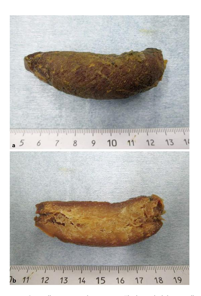
Fig. 2. Surgically exenterated specimen. a The huge, dark-brown, elliptical bezoar (diameter, 80 mm) after removal. b The cut surface of the specimen resembled the image from CT, with empty spaces retained in the interstices.

Yamamoto et al.: Small Bowel Obstruction Caused by Dried Persimmon