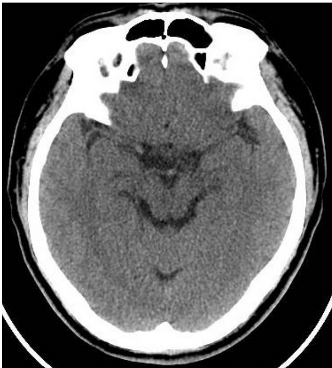
Fig. 1. Absence of acute brain parenchymal lesion upon initial computed tomography of the brain.

Spontaneous zonulysis of the left eye was diagnosed. The symp-