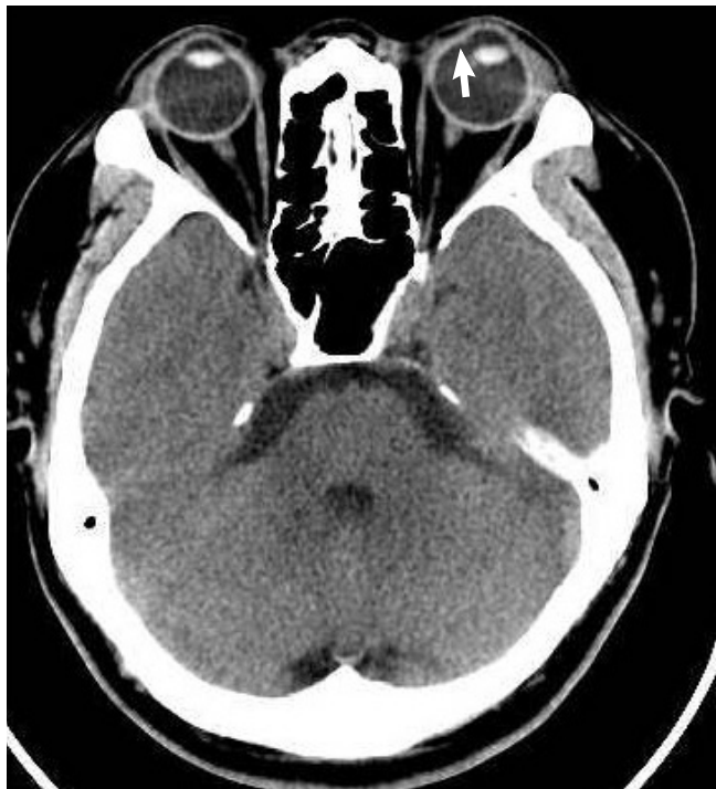
Fig. 3. Left lens subluxation due to zonulysis in the nasal area. Arrow shows displacement of the lens.

toms were attributed to a temporary pupillary block and angle closure glaucoma attack. So we recommended him to visit outpatient department and explained the possibility of laser iridectomy in case of aggravation of disease.