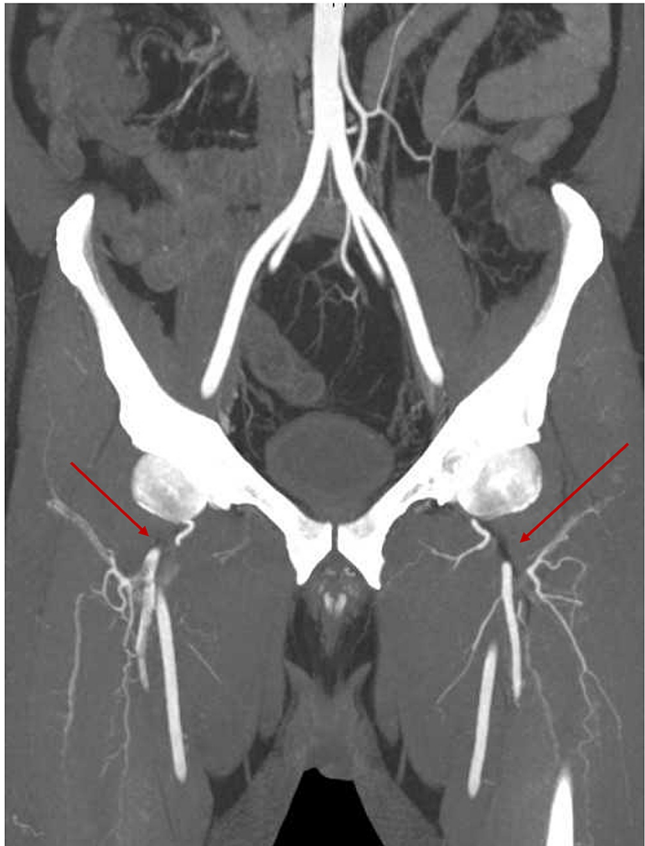
FIGURE 1: Computed tomography aortogram maximum-intensity projection showing filling defect within the profunda femoris artery bilaterally with a faint rim of contrast surrounding starting just distal to its origin and extending inferiorly as it gets its perforator branches

which he stayed in quarantine facility for 14 days. The patient started to have bilateral foot pain, which progressively got worse, so he attended the emergency department. Upon arrival, the patient had active severe bilateral foot pain with numerical rating scale of 8/10 with bluish discoloration of both big toes. Upon examination he was afebrile and his vitals were stable. Foot examination showed bluish discoloration of both big toes, cold and tender foot distally with absent dorsalis pedis and posterior tibial pulses on both sides; however, bilateral femoral pulses were strongly palpable. Bedside ultrasound showed normal abdominal aorta from epigastrium to bifurcation with no thrombosis. The patient was taken for CT angiogram of both lower limbs, which revealed severe multilevel lower limb arterial thrombosis/occlusions involving bilateral profunda femoris (Figure 1), bilateral anterior tibial, and tibioperoneal arteries (Figures 2, 3).