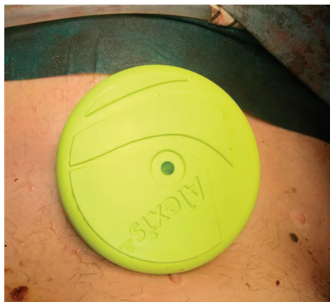
Figure 2. After the extraction of the specimen the cap of Alexis ® device is closed to re-establish pneumoperitoneum.

package (MedCalc Software, Mariakerke, Belgium). The Student and \chi^2 statistical test have been used to compare different variables. P < .05 was considered statistically significant. Receiver operating characteristic analysis was performed among independent variables.