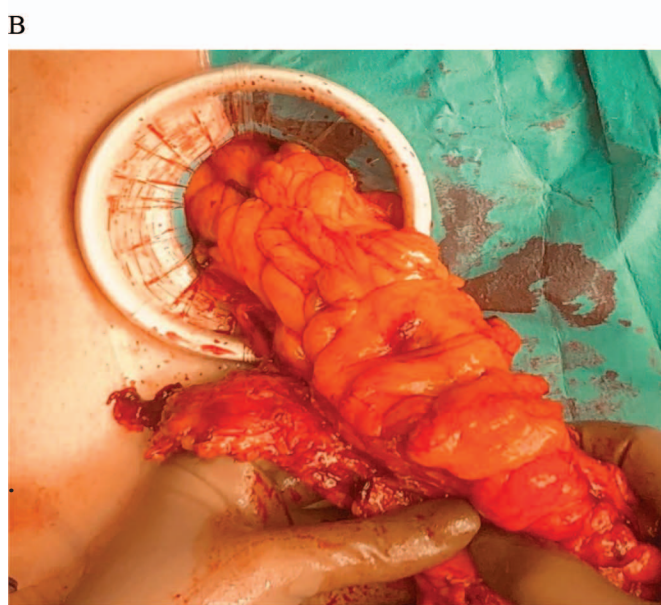
Figure 1. Insertion of the Alexis ® wound protector retractor after opening the peritoneum and extraction of the specimen. (A) The Alexis ® device is made up of two rings with a cylinder of polyurethane between the two rings. The outer ring is rolled over until it becomes taut circumferentially around the wound. (B) The Alexis ® device provides a 360° wound protection preventing bacterial abdominal invasion.

package (MedCalc Software, Mariakerke, Belgium). The Student and \chi^2 statistical test have been used to compare different variables. P < .05 was considered statistically significant. Receiver operating characteristic analysis was performed among independent variables.