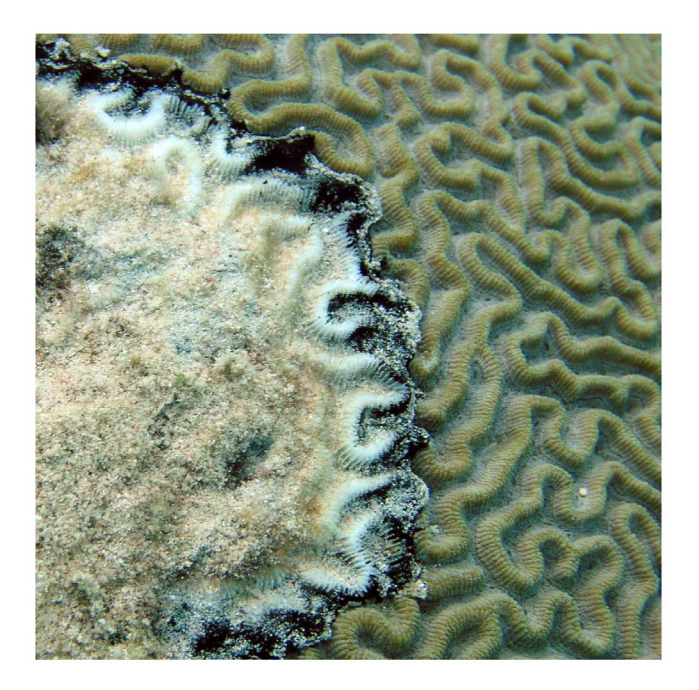
Figure 1. Black band disease infection on a colony of Diploria strigosa on a reef of Curaçao. The dark-colored black band disease microbial mat separates apparently healthy coral tissue from white, denuded coral skeleton. doi:10.1371/journal.pone.0108541.g001

Chemical signaling in tropical and subtropical coastal environments is a relatively unexplored area that may be important in coral health and disease. Quorum sensing (QS), a density dependent form of bacterial cell-cell communication, is one mechanism by which coral pathogenic bacteria and SML bacteria may be interacting [32]. Acyl-homoserine lactones (AHLs) and autoinducer-2 (AI-2) are two of the more well-characterized groups of QS signaling molecules [33]. The latter (AI-2) is a family of related molecules derived from (S)-4,5-dihydroxy-2,3-pentanedione (DPD) [34]. AHLs are considered to be intraspecies signaling molecules [35], although it has been shown that cross-