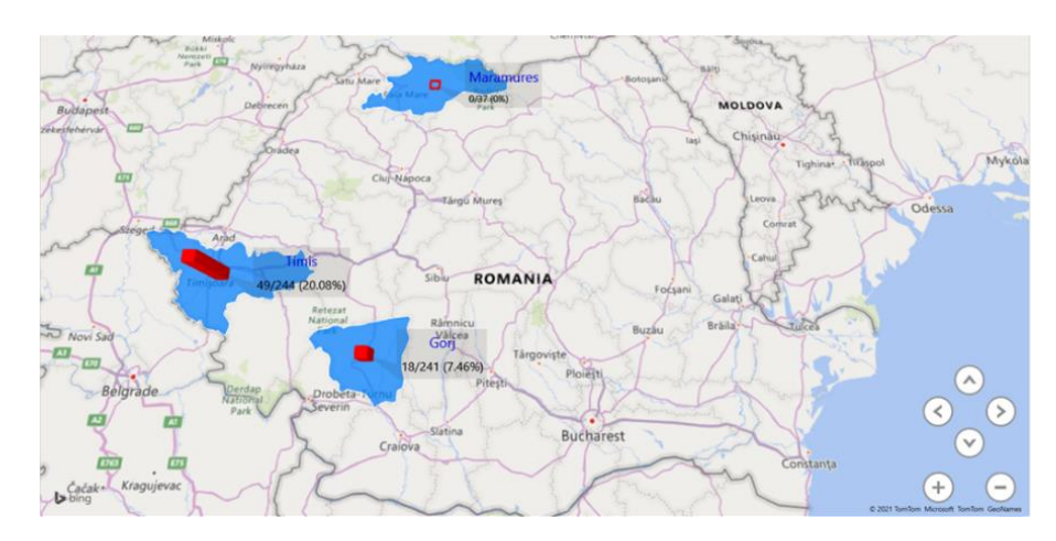
Figure 1. The geographical distribution of the Theileria equi seropositive samples.