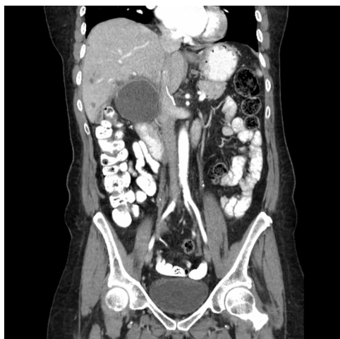
Fig. 2. Patent IVC post thrombectomy and tPA infusion.

Management of IVC thrombus has typically been with a heparin drip and transition to oral anticoagulants. Iguchi et al. demonstrated a similar presentation of compression leading to