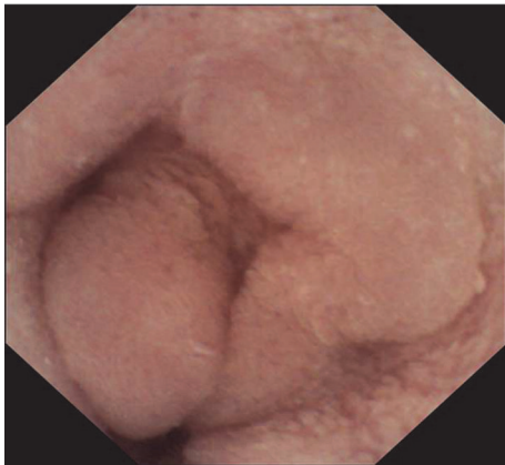
FIGURE 3: Video capsule endoscopy (VCE): One image from small intestine: No polyps seen.