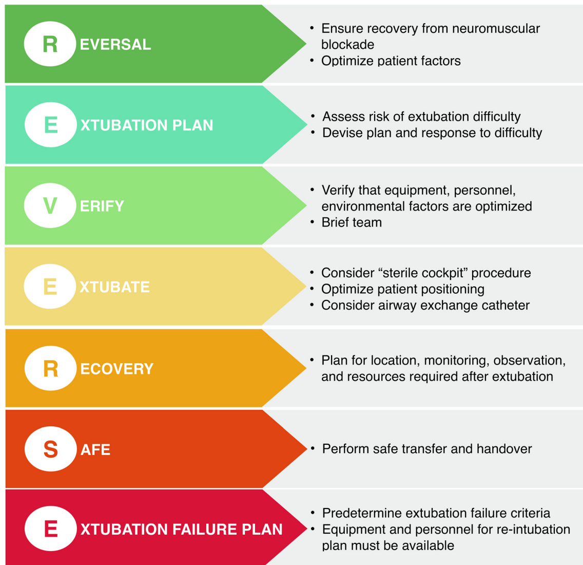
Fig. 2 Considerations for planning for safe tracheal extubation.

was originally difficult to intubate, or because of an interval event (Table 11).