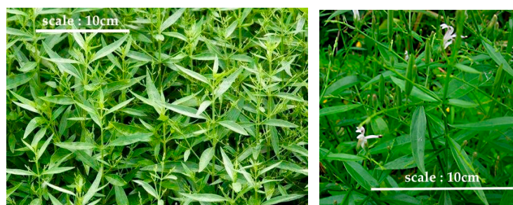
Figure 1. Andrographis paniculata .