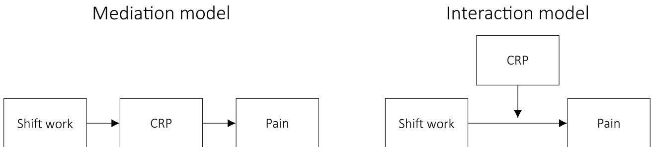
Fig. 1 Conceptual models

For dichotomous outcomes, binary logistic regressions were conducted to estimate relationships of shift work and CRP with “mild” or “severe” chronic pain. The estimates were presented as odds ratios (ORs), comparing the odds of having chronic pain with the odds of not having chronic