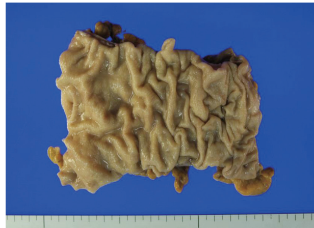
Fig. 2. Approximately half of the resected segment of the descending colon was dilated.

A segment of descending colon measuring 12 cm in length was received. Approximately half of the colonic segment was dilated (Fig. 2). The wall thickness appeared even without regional differences between the dilated and the narrowed portions. Except for the luminal dilatation, the colon was grossly unremarkable. Histologic examination revealed mild lymphoplasmacytic infiltrates with scattered eosinophils in the mucosa. The average number of eosinophils was less than 4 per high power field (HPF). The muscularis mucosa was thickened up to 660 \mu m in the dilated area in contrast to the thin muscularis