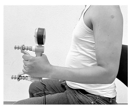
Fig 2. Handgrip strength evaluation using a handheld dynamometer. https://doi.org/10.1371/journal.pone.0254262.g002