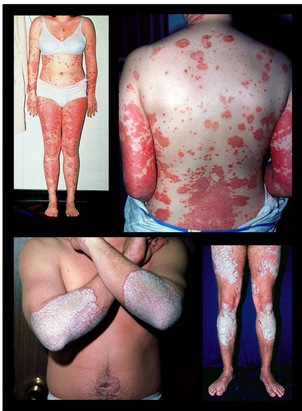
Figure 1 Plaque psoriasis.

Note: Classic examples of psoriasis which is characterized by well demarcated, erythematous plaques with an overlying silvery scale which can affect any area of the skin.