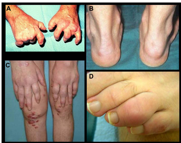
Figure 2 Psoriatic arthritis.

Treatment of psoriatic skin disease is based on disease severity and includes topical therapies for milder patients, phototherapy for mild to moderate disease, and oral systemic