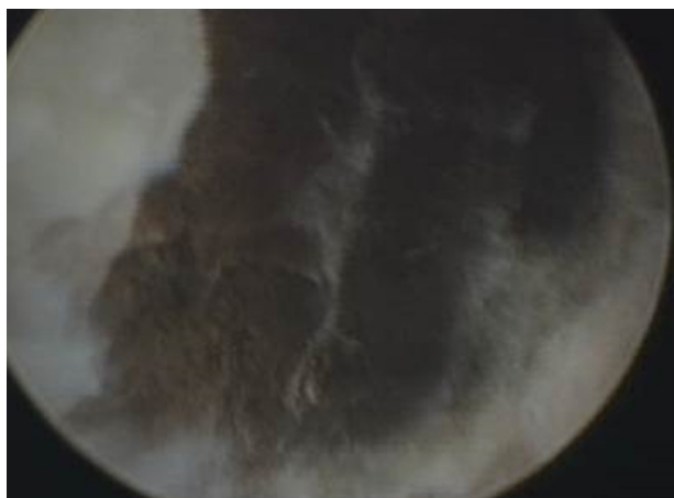
Fig. 1. Chondral lesion on medial femoral condyle.