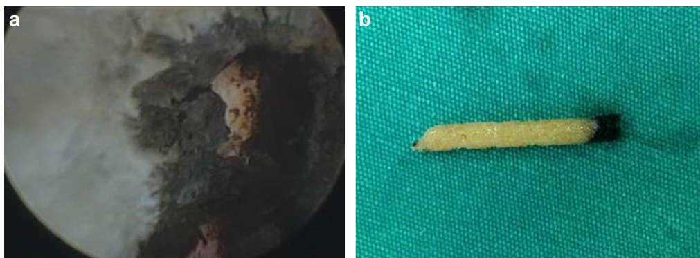
Fig. 3. Bone biopsy specimen shows the dark discoloration of the bony surface.

In ochronosis the most frequently involved joints are knee and hip. In ochronotic arthropathy, articular cartilage becomes more sensitive to mechanic stresses causing fragmentation and resulting in nonspecific tenosynovitis. The 50% of the patients present with knee effusion. 7 Our patient admitted to our clinic with knee effusion. High grade glenohumeral arthropathy is very rare but must be kept in mind in ochronotic arthropathy. Ochronotic arthropathy