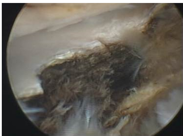
Fig. 2. Arthroscopic vision of torn lateral meniscus.

space revealed a large, yellow and black colored grade 4 chondral defect in the lateral tibial condyle. Lateral meniscus was thickened, black colored at the inferior surface and torn (Fig. 2). The partial meniscectomy was performed. Biopsy was taken from the black colored areas of femoral condyle (Fig. 3a and b).