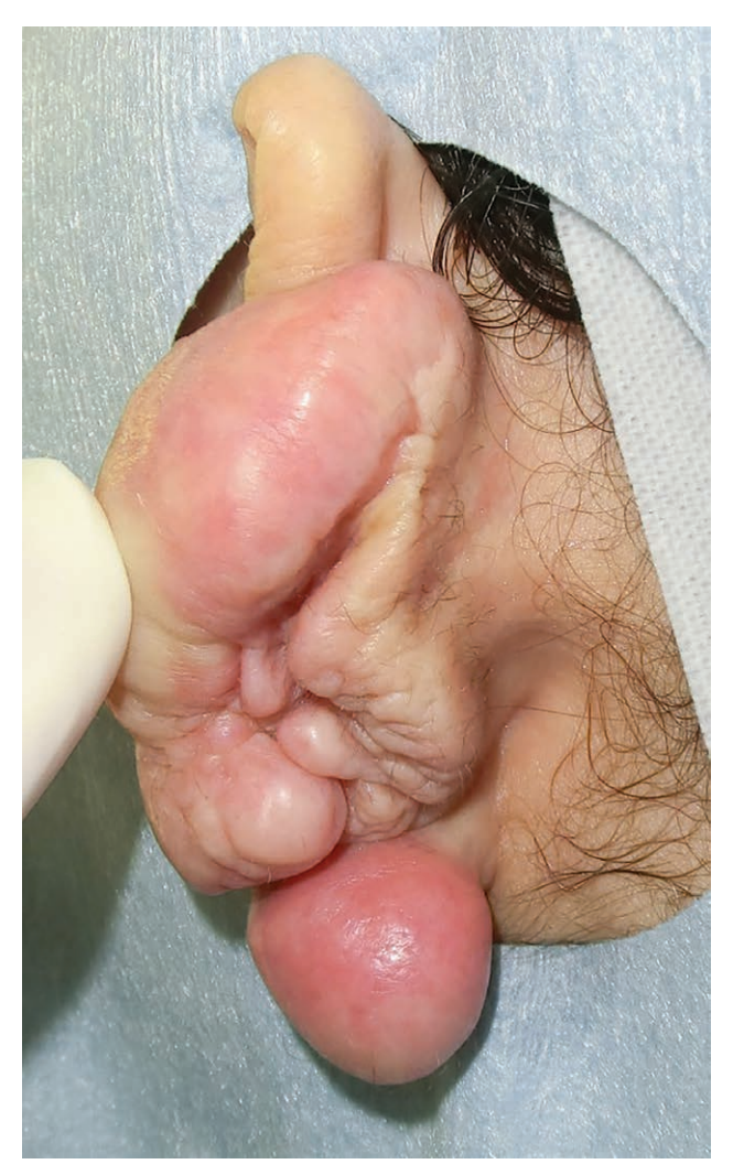
Fig. 2. A preoperative view of the postauricular sulcus. The border of the keloid and normal skin were ill-defined.

and papillary dermis are preserved and only the pathological hypertrophic reticular dermis is removed (Fig. 3). The retained skin was sutured to the wound bed with 6-0 polypropylene sutures that remained in place for 10 days. On postoperative days 1, 2, and 3, the patient received a total radiation dose of 15 Gy in 3 fractions over 3 days. The radiation was delivered by a 4 MeV electron beam.