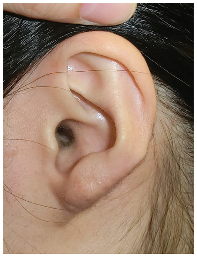
Fig. 4. A postoperative view 3 years after surgery and radiation therapy. There was no recurrence of pathologic scarring.

This is the first time that the onset of the rare lymphoproliferative disorder that is Castleman's disease has been shown to associate with keloid progression. This finding is not entirely surprising, given that Castleman's disease results in a proinflammatory systemic state due to high serum levels of IL-6 and keloids appear to be driven by persistent inflammation. Moreover, there are numerous lines of evidence showing that IL-6, which is a potent immunomodulator, is a common causative factor of keloid pathogenesis. In particular, the stem cells in keloids exhibit features of benign tumor cells, namely, uncontrolled self-renewal and proliferation, and these features are driven by IL-6 via an autocrine/paracrine axis.<sup>10</sup> This dysregulation of growth and persistent expansion are key characteristics of keloids.