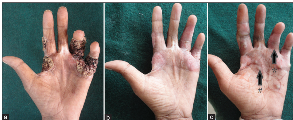
Figure 1: Hand involvement in herpes simplex (a) Crusted verrucous plaques on presentation. (b) Complete resolution, 2 weeks after tablet acyclovir 400 mg, TID. (c) Two months later; #fresh vesicle, *contracture upon healing

serving as an additional public health benefit and increasing the survival. [1]