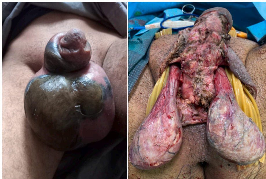
Fig. 2. Appearance in favor of scrotal gangrene in a 45-year-old diabetic patient whose starting point was AO aggravated by the use of non-steroidal anti-inflammatory drugs. The patient was undergoing surgical scrotal necrosectomy.