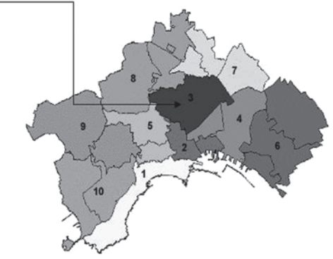
The 3° Municipality in Naples (3)

This is a pilot study evaluating the feasibility and reliability of the characterization of the oncology population of a central zone of Naples through the analyses of the medical records of GPs practicing in that area. In the present study we also evaluated the impact of cancer on the general population residing in the center of Naples by reviewing GPs' clinical charts. Relevant clinical characteristics such as age, gender and site, based on the International Classification of Disease, ninth revision (ICD-IX), were analyzed in GP medical databases for cancer patients residing in that area and the cancer prevalence in Naples was determined.