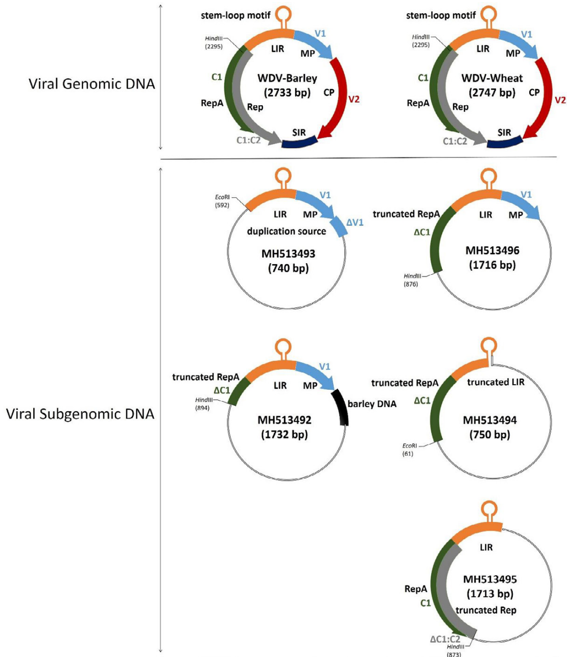
Figure 3. Genomic (top) and subgenomic (bottom) organization of WDV-Wheat (right) and WDV-Barley (left) isolates obtained from the infected wheat and barley plants, respectively. The positions of large and small intergenic regions (LIR and SIR, respectively) and the putative stem-loop motif in LIR are shown. Locations of the two unique sites of restriction enzymes (HindII and EcoRI) used for releasing gDNAs and sgDNAs are also shown. The corresponding ORFs and encoded proteins are indicated (V1, CP (coat protein); V2, MP (movement protein); C1, RepA (replication-associated protein A) and C1:C1, Rep). The sgDNAs having undergone deletion, duplication and insertion events are shown. ORFs with deleted sequences are specified with delta ( \Delta ) symbols. Hollow lines show deleted regions of the genome. The nucleotide positions of restriction sites on full-length genome sequences given in parenthesis are based on GenBank accessions MH477620 and MH477616 for WDV-Wheat and WDV-Barley, respectively

derived sgDNAs lacking SIR sequences in natural infections. A similar case was reported about sgDNAs characterized in maize plants infected with Maize streak mastrevirus (21). Regarding the rapid emergence of new geminiviruses (41), these molecules might be