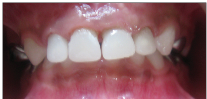
Figure 5: Post-operative view of restored maxillary incisors