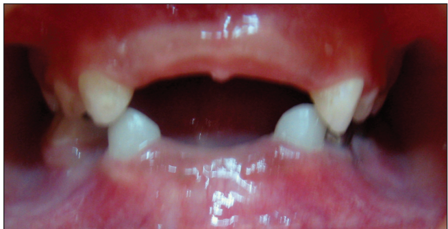
Figure 10: Post-operative view