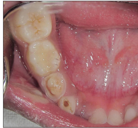
Figure 12: Final tooth preparation and pulp protection with glass ionomer cement

The management of totally broken down primary teeth is carried out in two phases; core build up followed by restoration of the crown anatomy. A multitude of methods has been used for intra-canal reinforcement for anterior teeth such as composite posts, [1] short wire posts (omega loop), [8] Ni-Cr coil spring posts, [2] readymade glass fiber posts, [9] ribbon [10] and dentinal posts. [11] The crown anatomy can be restored by direct composite build up by incremental method, [8]