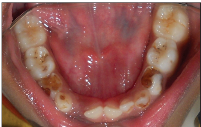
Figure 11: Pre-operative view of mandibular arch showing decayed 84