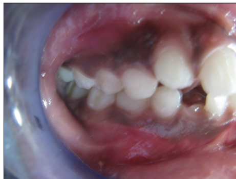
Figure 14: Final post-operative view showing teeth in occlusion

composite build up using celluloid strip crowns, [1,9] composite build up by indirect technique, [2,10] open faced stainless steel crowns, [3] resin veneered stainless steel crowns, [12] enamel veneers and biological shell crowns. [9,13]