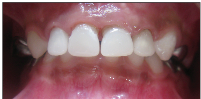
Figure 6: Post-operative view at 12 months follow-up