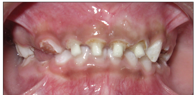
Figure 3: Dentine posts cemented in place