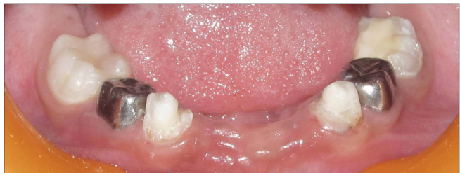
Figure 9: Dentine post and core units cemented in place. Appreciate the amount of tooth structure replaced with these post and core units, which needed application of minimal thickness of composite during final buildup