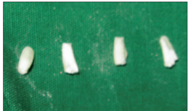
Figure 2: Prepared dentine posts. Note almost cylindrical shape of posts