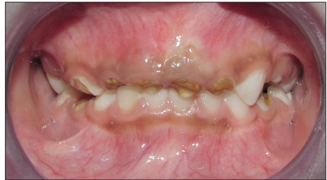
Figure 1: Pre-operative view showing decayed maxillary incisors

Step 7: Filtek™ Z350 XT supreme universal restorative (3M™/ESPE™ Dental Products, USA) composite material was condensed in celluloid strip crowns with due care being given not to entrap any air bubble. It was seated on incisor to be restored and extra composite material was removed from gingival margins and palatal hole before curing. Curing was