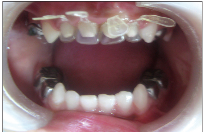
Figure 4: Trial fit of strip crowns

Step 5: Cementation of post and core unit was done in a similar way as described for the previous case [Figures 8 and 9].