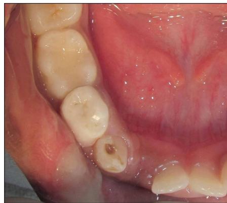
Figure 13: Trial fit of biologic shell crown. Note the occlusal disharmony at distal marginal ridge at this stage. Significant trimming was done, mainly at cervical margin, to ensure proper seating. Also, note the improper mesial contour, which needed minor adjustments