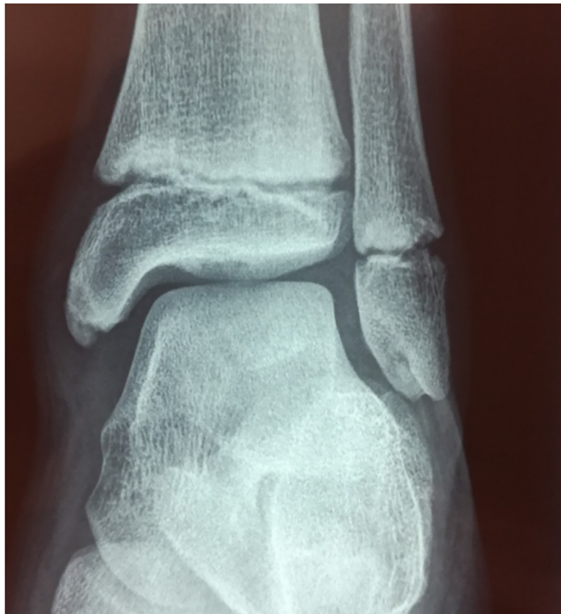
Fig. 1. Anteroposterior of the 12-year old patient showed a radiolucent alteration at the apex of the left medial malleolus. The rest of the ankle joint is normal.

No lower limb discrepancy or malalignment were observed. The radiography showed a radiolucent focal uptake in the medial malleolus apex and a partially fused secondary ossification center of the medial malleolus (Fig. 1). Thickening of proximal portion of the deltoid ligament was revealed with an ultrasonography evaluation. Inflammatory and infectious diseases were excluded after laboratory exams and it was decided to treat this ankle by a short leg cast for a four week period. At this time the state of the patient was reassessed but the pain resumed at the medial part of the ankle. A CT scan and a MRI were performed. CT scan showed fragmentation at the tip of the medial malleolus (Fig. 2) and MRI demonstrated the presence of fragmentation and bone-marrow edema at the medial malleolus (Fig. 3) which led to the diagnosis of osteochondrosis of the medial malleolus.