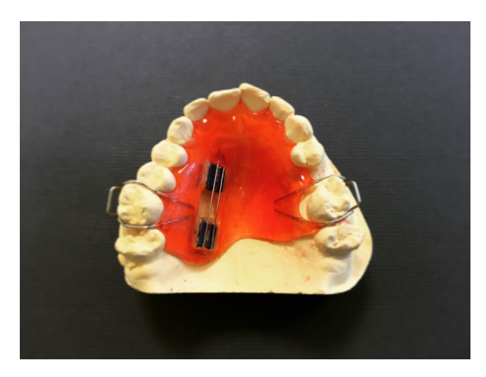
FIGURE 1 Intraoral appliance fitted with two enamel samples

This was a single centre, double-blind, randomized, two-treatment, four-period crossover study that was a variation of the previously published method of Hooper et al<sup>24</sup>. During the screening visit prior to the start of study treatments, recruited participants were provided with a non-treatment 0.32% NaF (1450 ppm fluoride) marketed dentifrice (Crest® Decay Protection dentifrice, Procter & Gamble) and manual toothbrushes (Oral-B®35 manual toothbrush, Procter & Gamble) to use at home, both prior to and during the course of the study. Participants were required to use these two