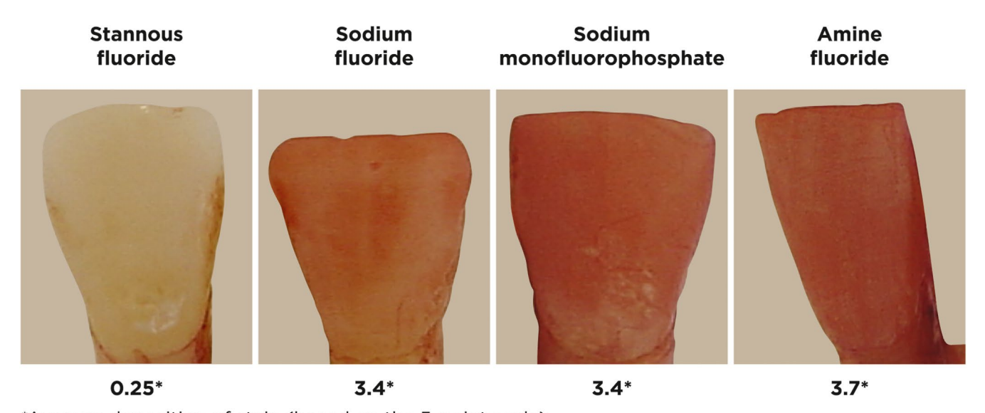
*Average deposition of stain (based on the 5-point scale)

The stannous fluoride dentifrice included in this randomized in situ clinical trial demonstrated significantly greater erosion protection