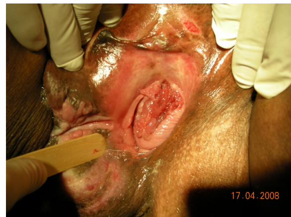
Fig. 2 The vaginal examination revealed a 10 cm opening permitting the urinary bladder wall to prolapse into the vagina

which had resulted in dilatation and pressure necrosis of the urethra with subsequent severe incontinence.