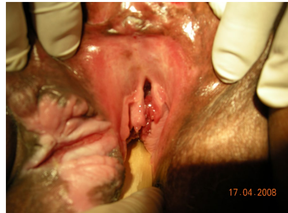
Fig. 1 The vaginal examination revealed destruction of the urethra

A 46-year-old paraplegic woman presented to the outpatient urology department, complaining of recurrent febrile urinary tract infections and severe urinary incontinence for 2 years. She suffered from persistent malodorous urine and skin breakdowns from constant urine leakage. She typically used long-term urethral catheters,